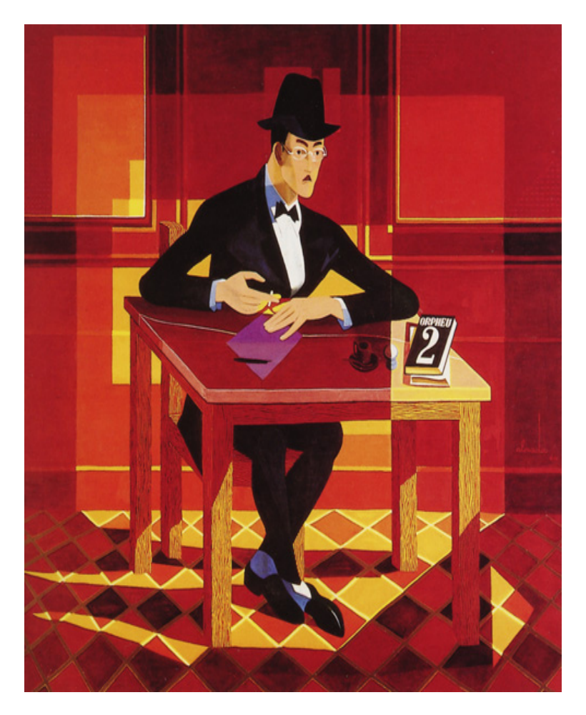
Figure 6: José de Almada Negreiros, Retrato de Fernando Pessoa [Portrait of Fernando Pessoa], 1964, oil on canvas, 226x225 cm, Coleção do Centro de Arte Moderna, Fundação Calouste Gulbenkian, Lisboa

Slightly younger than the other two artists discussed here, self-taught polymath José de Almada Negreiros was, like Wyndham Lewis, active from an early age as a painter and decorative artist, and also as a writer, poet, critic, polemicist and performing artist. In his youth, he was perhaps the only self-assumed Portuguese futurist. He and António Botto (1897-1959) were the two Portuguese modernist poets that Fernando Pessoa translated into English. The literary dimension of the Almada-Pessoa friendship is reminiscent of the relations between Picasso and Stein and between Lewis and Eliot. The apparent parallels, however, end here. Short-sighted, bookish and interested in the invisible, Fernando Pessoa (1888-1935) seems to have developed his power for the visual depictions in his verse and prose by assimilating poetic-literary models. Before meeting Almada Negreiros personally, the reading of Walt Whitman provided young Pessoa with an acute awareness of the importance of having his eyes open to the outer reality if he was to write good verse. Fernando Pessoa was among the first to recognize the talent of Almada, as a young visual artist in 1913, by underlining the satirical force of his cartoons and drawings.