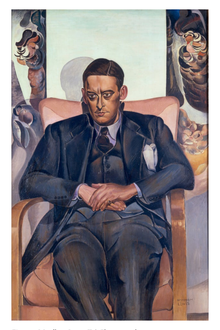
Figure 2 : Wyndham Lewis, T. S. Eliot , 1938, oil on canvas, 133.3 x 85.5 cm, Durban Art Gallery, © 2020 – Wyndham Lewis Estate/Bridgeman Images (United Kingdom) [This image cannot be used or copied without the permission of the Estate and Bridgeman Images]