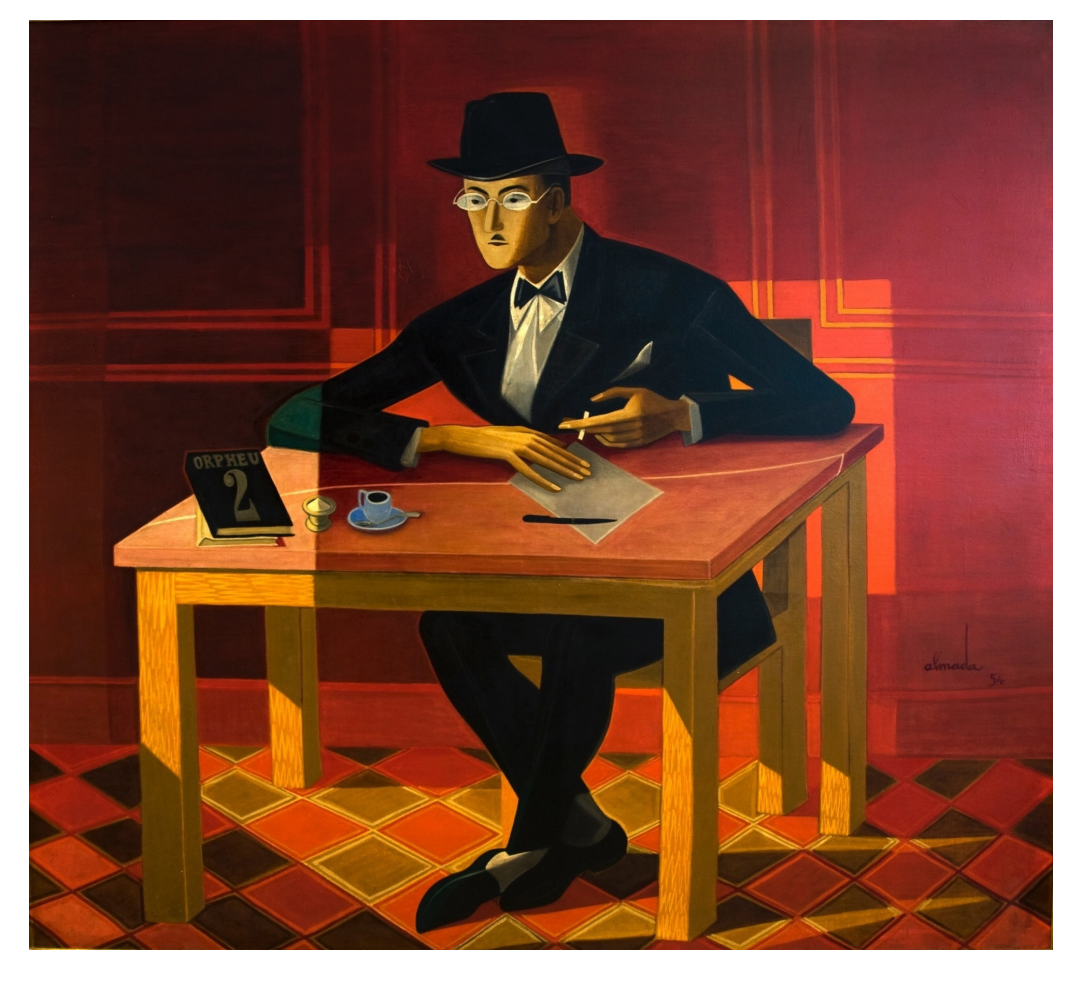
Figure 5: José de Almada Negreiros, Retrato de Fernando Pessoa [ Portrait of Fernando Pessoa ], 1954, oil on canvas, 201x201 cm, Colecção do Museu de Lisboa/Câmara Municipal de Lisboa – EGEAC (nº de inventário MC.PIN.410), on loan to the Casa Fernando Pessoa, © 2020 – Herdeiros de Almada Negreiros/SPA (Portugal).